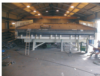
Vibration grate at test assembly in workshop.

The next step in the development of converting the plant from purely fossil firing to mainly biomass firing was taken in November 2008, when Dong Energy awarded BWE the contract for the supply